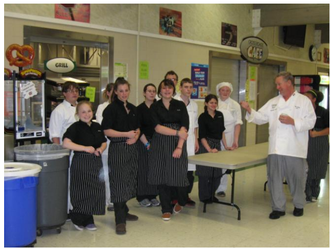
The Chef and Staff