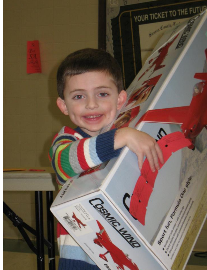
This little guy came to party expecting to win a plane – Santa made his dream come true.