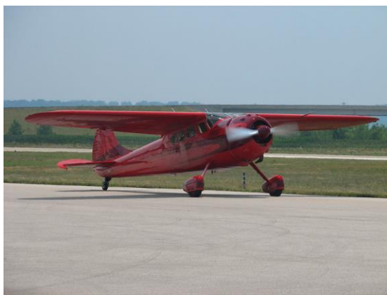
Figure 1 Finished plane pictured from vendor.

Craig bought the plans and had the Precision Cut Kits produce a kit for him back when Larry Contana owned it. You can follow the progress on rcscalebuilder.com if you are interested.