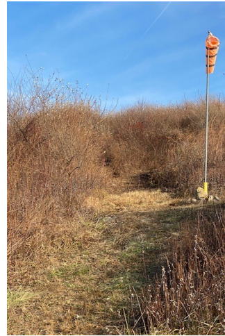
Path behind the wind sock to the top of the ridge.